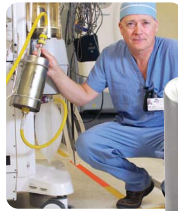
Portable Canister installed in the OR